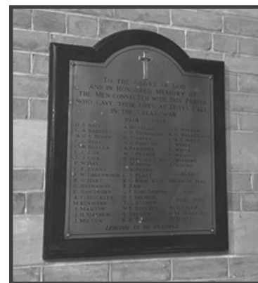
Below: new location for the war memorial plaques

I put the question to the Church Council who readily agreed and so that is what we are planning to do, funds permitting.