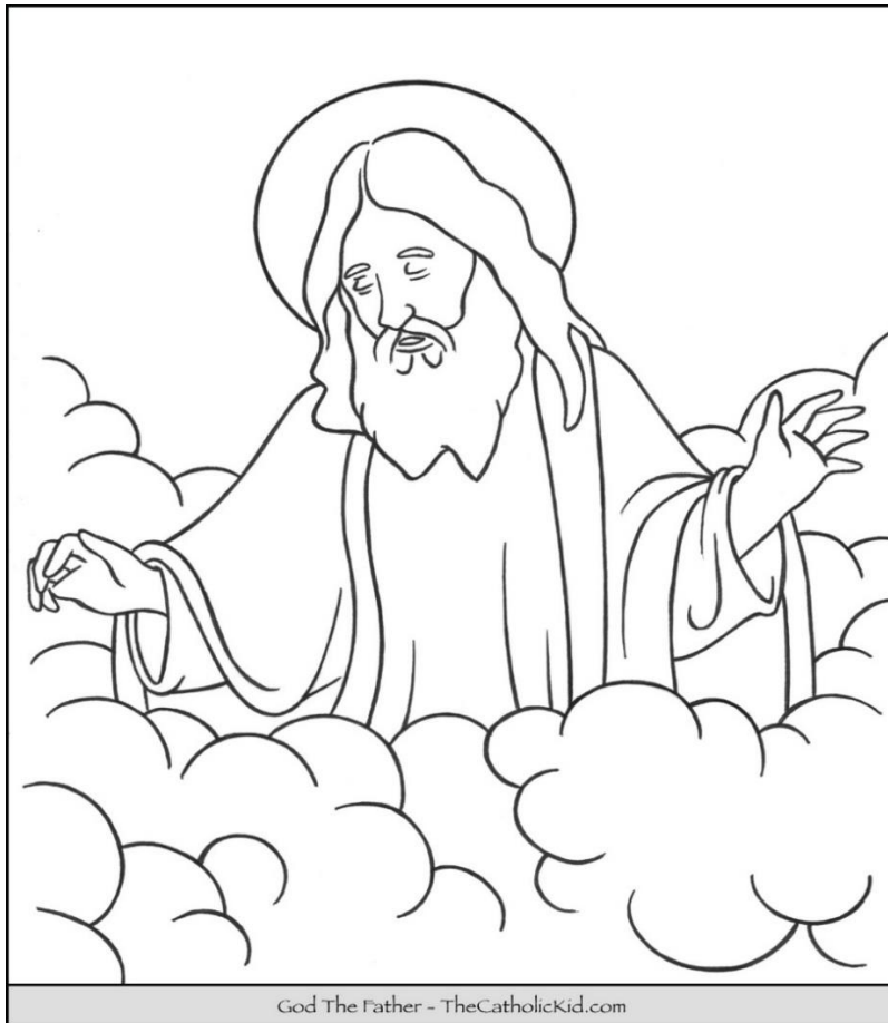
God The Father - TheCatholicKid.com