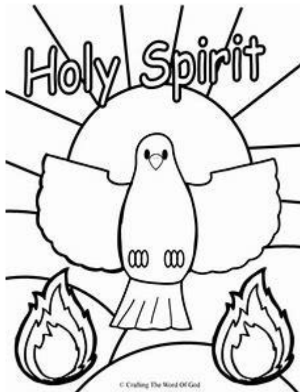
© Creating The Word Of God