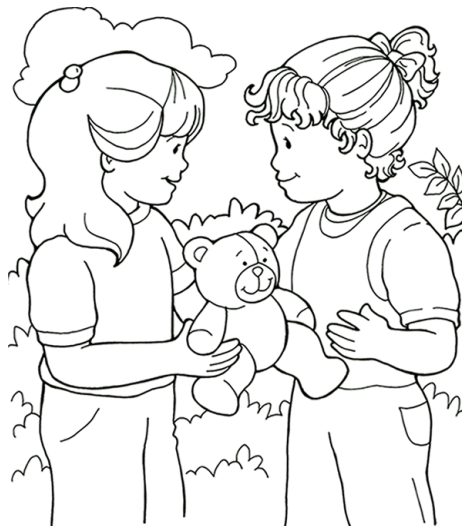
I can follow Jesus by sharing.

What can we do so that Jesus is pleased with us? Let's share anything we can, like the lady in the story. Start by sharing a smile wherever we go! Then think about doing things to help other people. When the teacher asks for a volunteer to do a job for him or her, put your hand up. When your mum or dad wants help with the washing up, say, 'I'll help!'. When your little brother or sister needs help getting shoes on, ask if they'd like your help. (best to ask first, they may be working hard on being independent!) Best of all, do something kind without being asked. Pick up a glove that someone has dropped, offer your last chocolate to your friend, ask someone who looks lonely to play with you in the playground. Be kind when someone falls over.